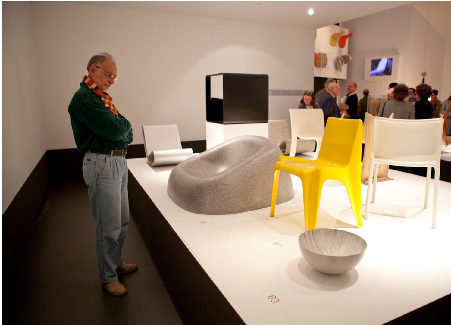
Vitra Design Museum - exhibition „The essence of things. Design and the art of reduction“ 20.03.-19.09.10 Weil am Rhein